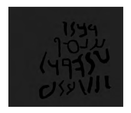
Plate 3e: A tracing of al-Dīyīb 2002: no. 159.