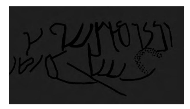
Plate 3c: A tracing of al-Dīyīb 2002: no. 88.