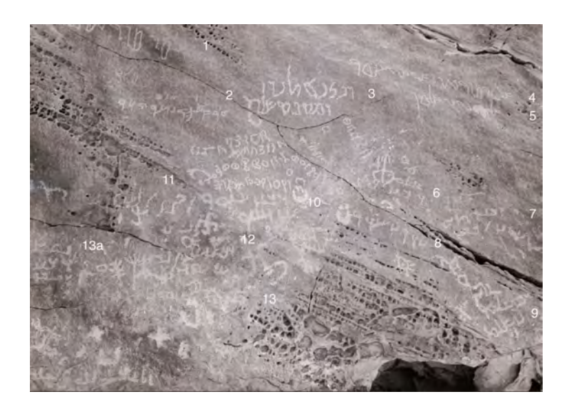
Plate 4: ARNA Nab 1–13 , + one fragmentary Nabataean text (13a: {b/n}<sup>e</sup>š---- // dkyr ---- // br mlkw ----) not read by Milik and Starcky. (Photograph Winnett and Reed, = 1970: Pl. 10. The original is in the Winnett Archive, see note 2).