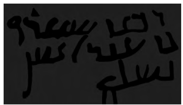
Plate 3a: A tracing of al-Dīyīb 2002: no. 128.