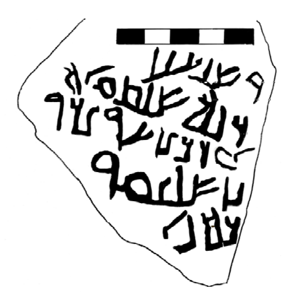
Plate 2: ARNA Nab 17, facsimile