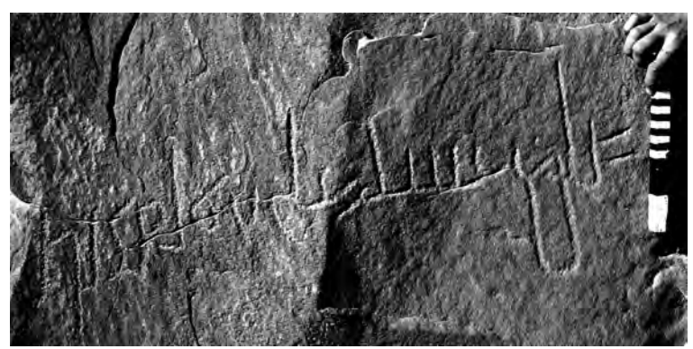
Plate 3b: CIS ii 947.