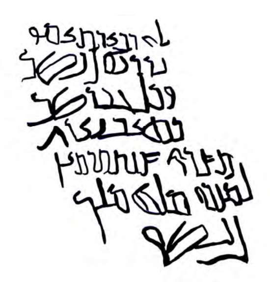
Plate 3d: A tracing of al-Dīyīb 2002: no. 134.